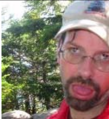
"Can I sleep yet?" Running on zero sleep on N. Tripyramid