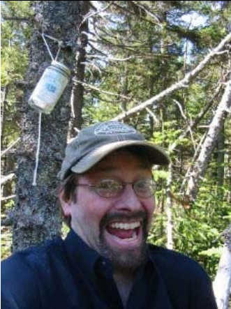
"I can find a jar 60 yards off the trail!" aka "Jar Joy!" 1 st jar ever on Blue Ridge (Kinsman Ridge Tr.)