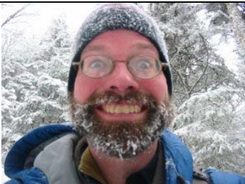
Frosted on Mt. Tom – forgot the caption... probably something about how much I love lack of views...