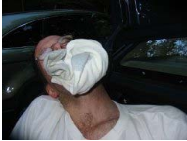
"Cotton Kills!" After Weeks/Waumbek