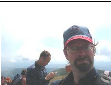
"Salty hikes with people!" Moosilauke