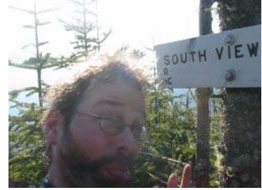
"Do I really need a sign to tell me it's a view??" Mt. Crescent