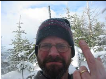
My thoughts on Owl's Head. Unpublished.