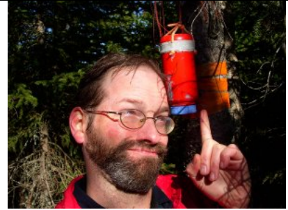
"THERE'S that jar" Wandering through 25 minutes of thick young firs on Huntington, west peak