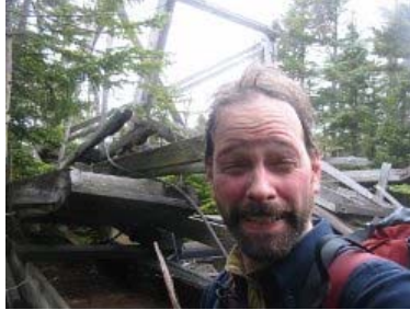
"Bemis and Butthead" Mt. Bemis