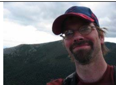
"Baldface and not so bald face" Baldfaces, duh...