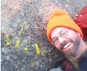
"Another brilliant "View" announcement" Paugus