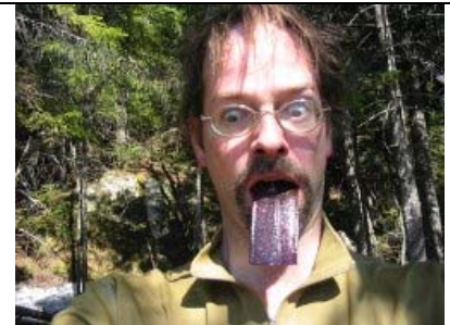
Forgot this caption, too. That's a fruit rollup as a tongue. Lookout Ledge, Randolph.