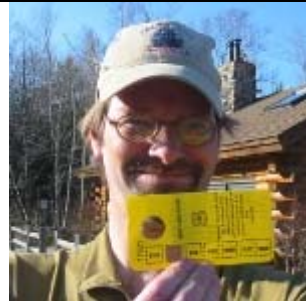
"Success!" How to avoid a fine at Lincoln Woods, Lower Pemi hike