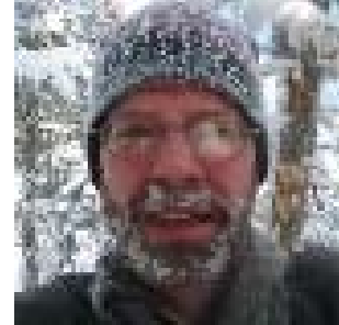
"10 below makes me happy!" Pliny